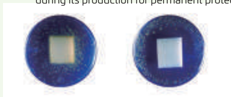
Plastic sample without Microban® anti-microbial ingredients.