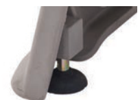
Optional Non-slip Feet Pad Set (8016) can increase the stability of the child seat

*Microban® is the registered owner of Microban® trademark, and reserves all the rights. Microban® anti-microbial protection is not designed to protect users against disease causing micro-organisms and is not a substitute for routine cleaning.