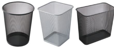
STAINLESS STEEL TRASH CANS